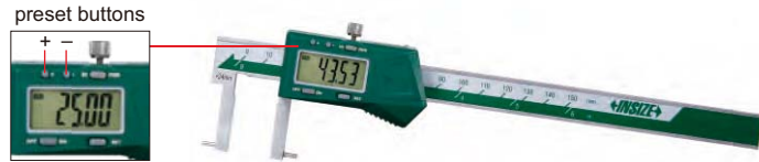
1121-150A type A