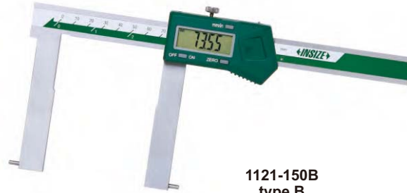
1121-150B type B